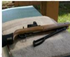
Bolt open, charging handle open