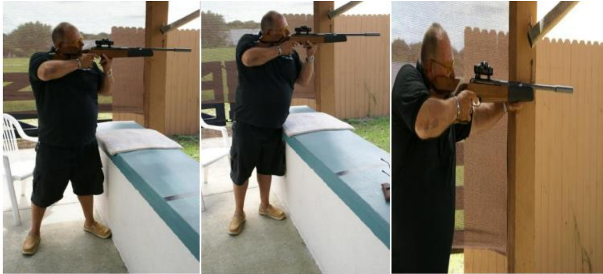
Proper Offhand Rifle position. Leaning into shooting bench creating artificial support, not acceptable. Using artificial brace (wood) for support, not acceptable.

A properly used rifle strap is permissible.