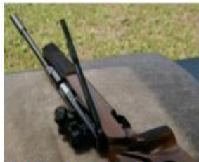
Rifle showing open Chamber.

When finishing your match promptly remove your equipment to allow others who may follow the opportunity to do the same.