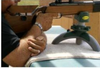
Anybody position will be acceptable.