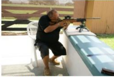
Sitting with one hard point under the stock.