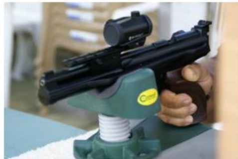
Pistol being supported by TWO hard points.

(The illustration below demonstrates an unacceptable bench rest position)