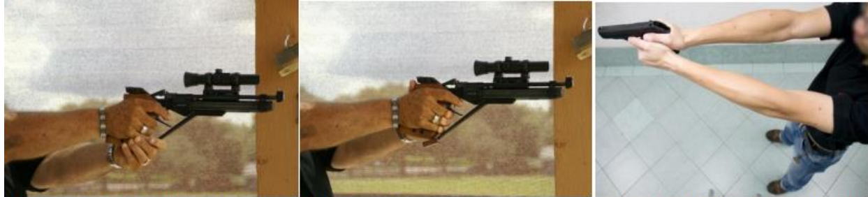
Two handed grip, supporting hand in contact, arms extended elbows

***** (See illustration below of accepted two handed match pistol positions) *****