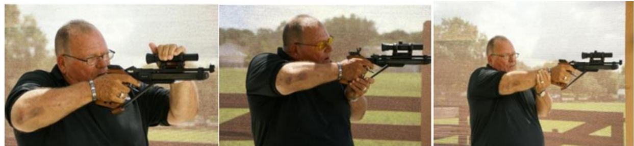
Arms not extended, hands apart bridging body with arms.

*** ( See illustration below of positions that are NOT acceptable two handed match pistol positions) ***