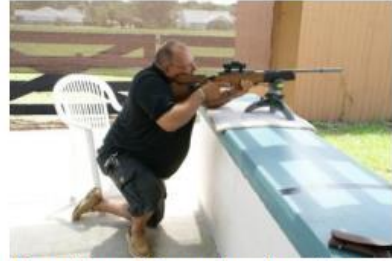
Kneeling with one hard resting point.