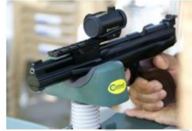
Pistol resting on one hard point supported by hands. Note the different hand positions. Both are acceptable.

(The illustration below demonstrates an unacceptable bench rest position)