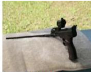
Bolt open charging handle